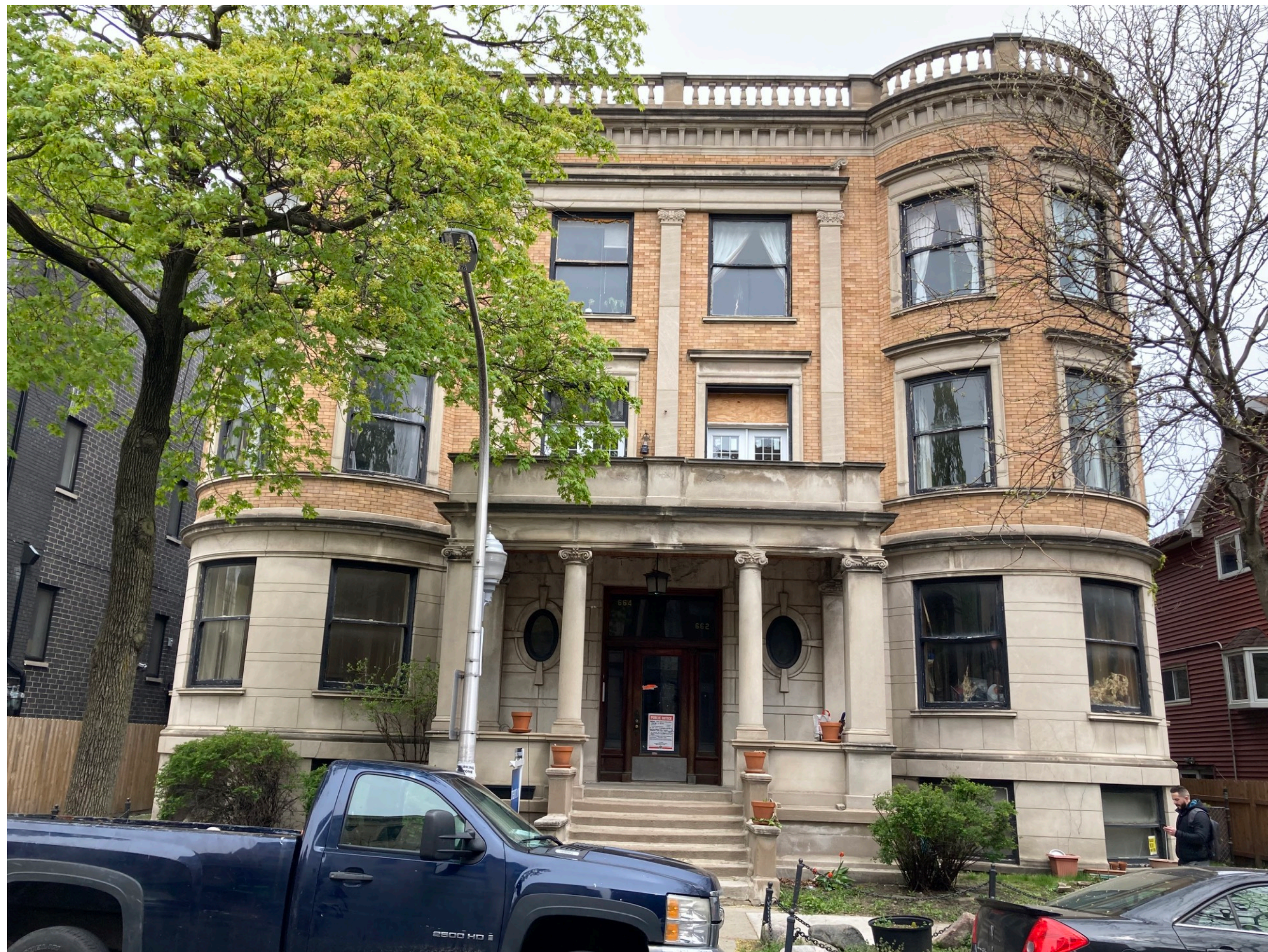
662-664 West Wellington Ave Lakeview Historic District

Existing Historic Building to be Restored and Renovated