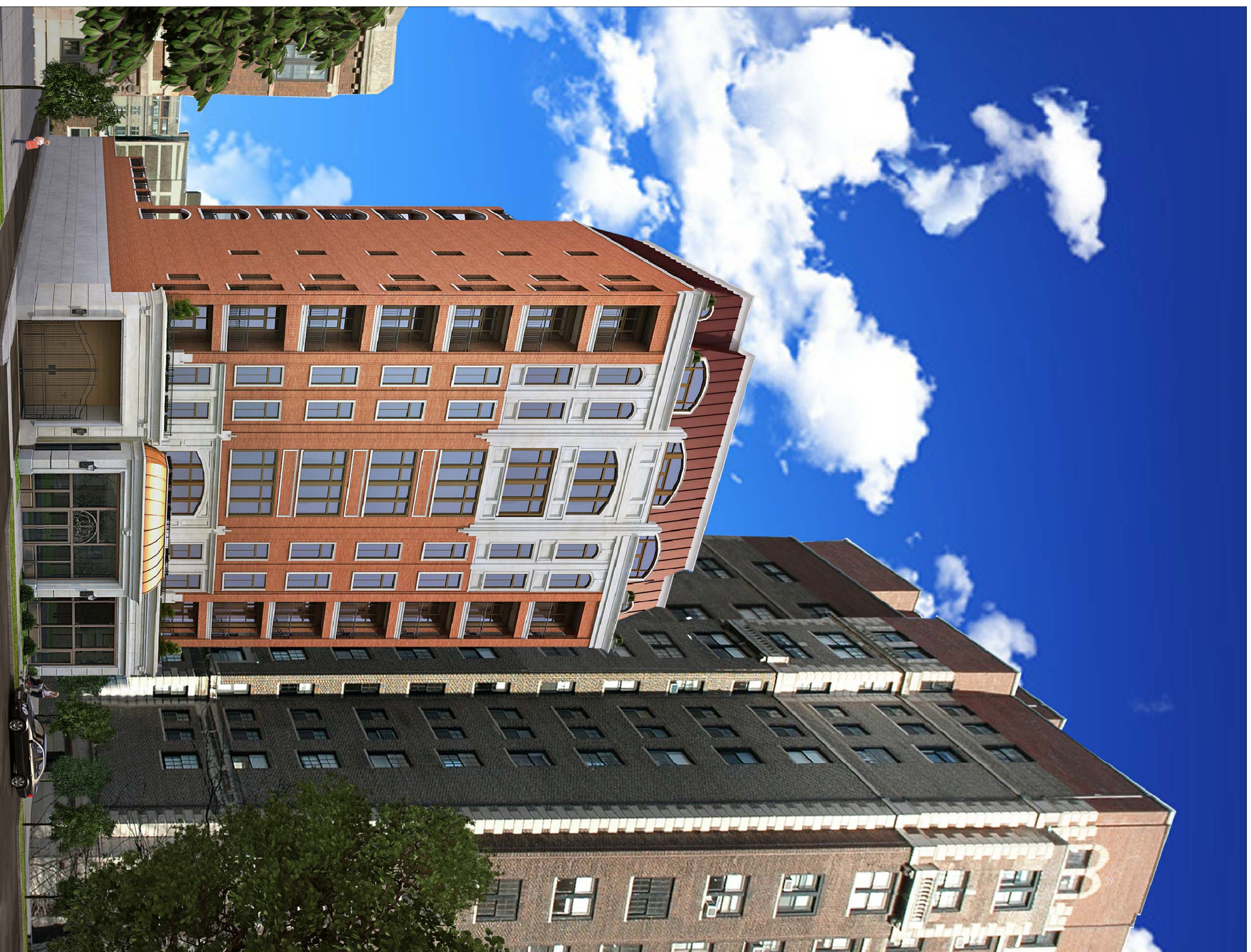
Front Elevation Perspective